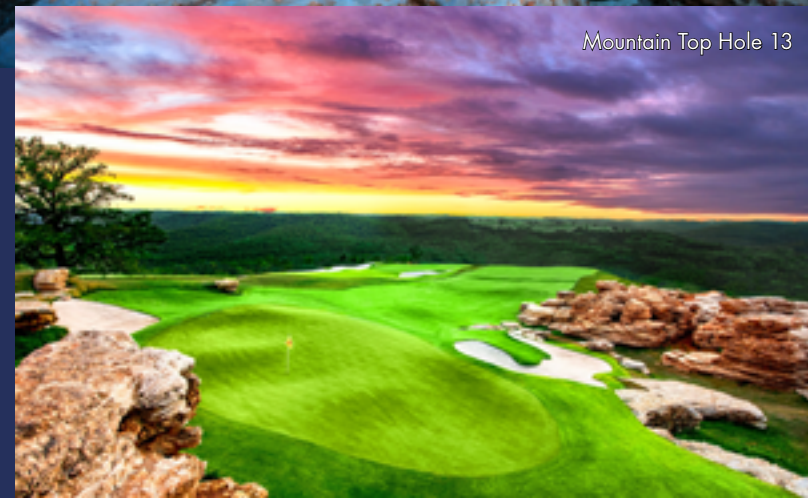
Mountain Top Hole 13

wooden beam and plank bridge, which connects the tee box and fairway of the 13th hole and stands 60 feet above a flowing creek.