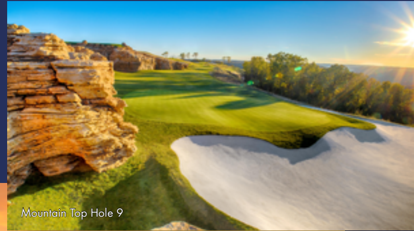
Mountain Top Hole 9