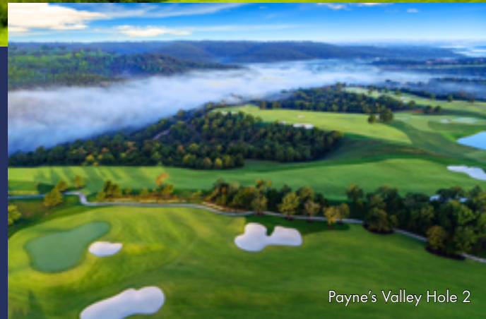
Payne's Valley Hole 2