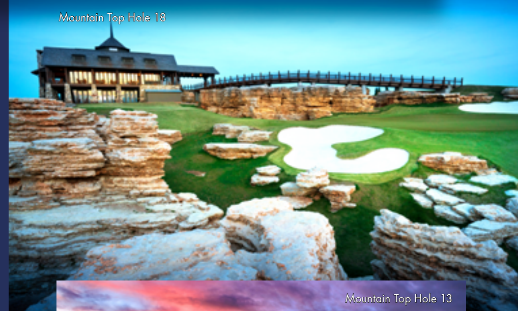
Mountain Top Hole 18