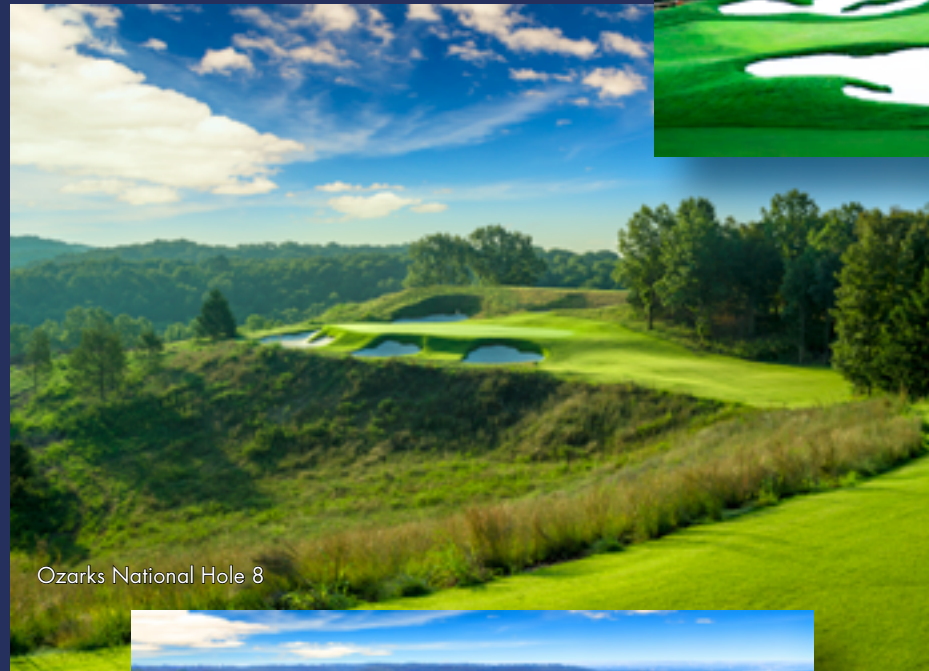
Ozarks National Hole 8