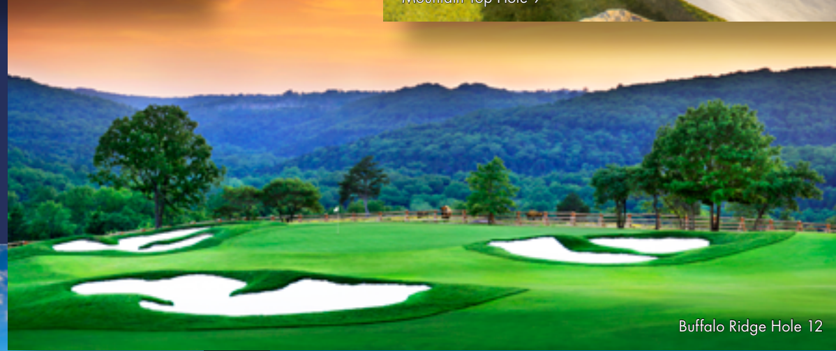
Buffalo Ridge Hole 12